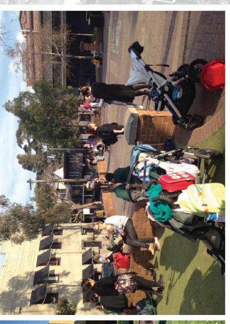
2 View looking south towards playground and paved mosaic square